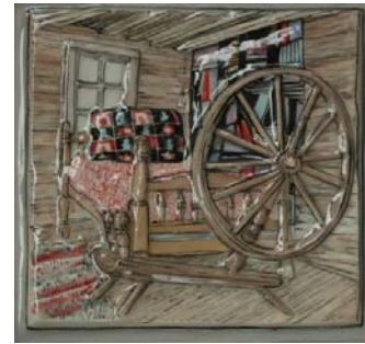
Inset from cover image