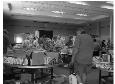
So many choices! Book lovers search for the perfect selection for them.

If you'd like to donate books, just drop them off at the library anytime throughout the year.