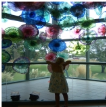
Children are fascinated by the play of lights through Blooms .