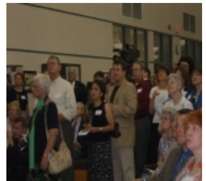
More than 125 people visited the Library during the Open House specifically to see Blooms of Enlightenment .

Blooms of Enlightenment David Keens August 2005