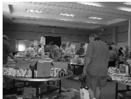
So many choices! Book lovers search for the perfect selection for them.