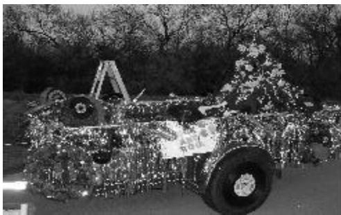
ELF Float is in line and ready to go on parade night.

For more pictures, visit the photo gallery at www.euleslibraryfoundation.org